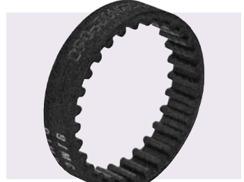
Continued on the next page

MATERIAL: Nylon Covered, Fiberglass Reinforced, Neoprene BREAKING STRENGTH: 158 N per 1 mm (113 lbs per 1/8) belt width; not representative of the load-carrying capacity of the belt. WORKING TENSION: 507 N for 25.4 mm belt (114 lbs for 1 in. belt). For more information, see the technical section. TEMPERATURE RANGE: -34°C to +85°C (-30°F to +185°F)